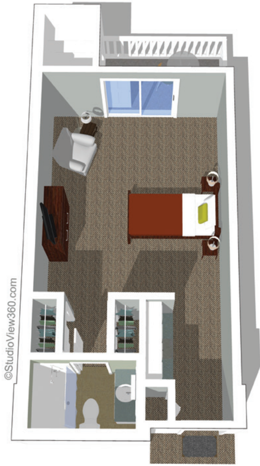
Assisted Living Studio Suite Three 392 square feet