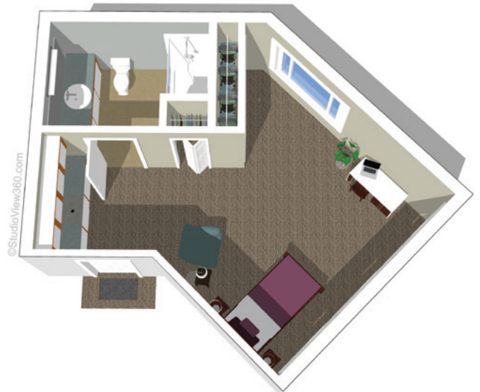
Assisted Living Studio Suite Two 355 square feet