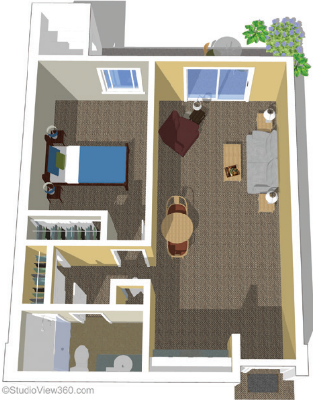
Assisted Living One Bedroom 605 square feet