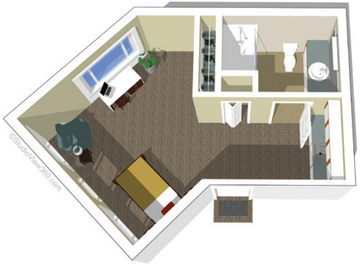
Assisted Living Studio Suite One 381 square feet