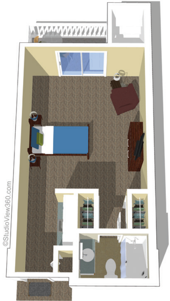
Assisted Living Studio Suite Four 392 square feet