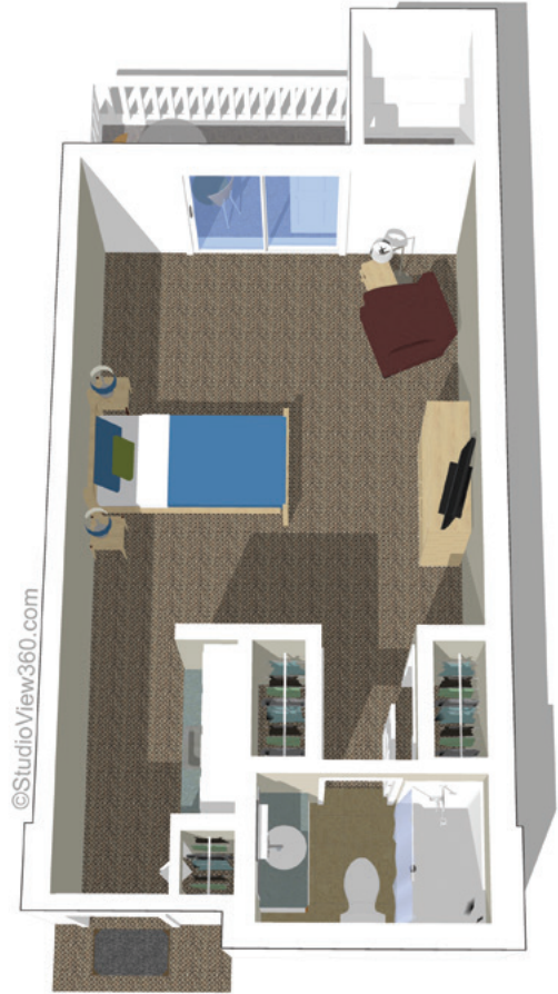
Memory Care Companion Suite 650 square feet